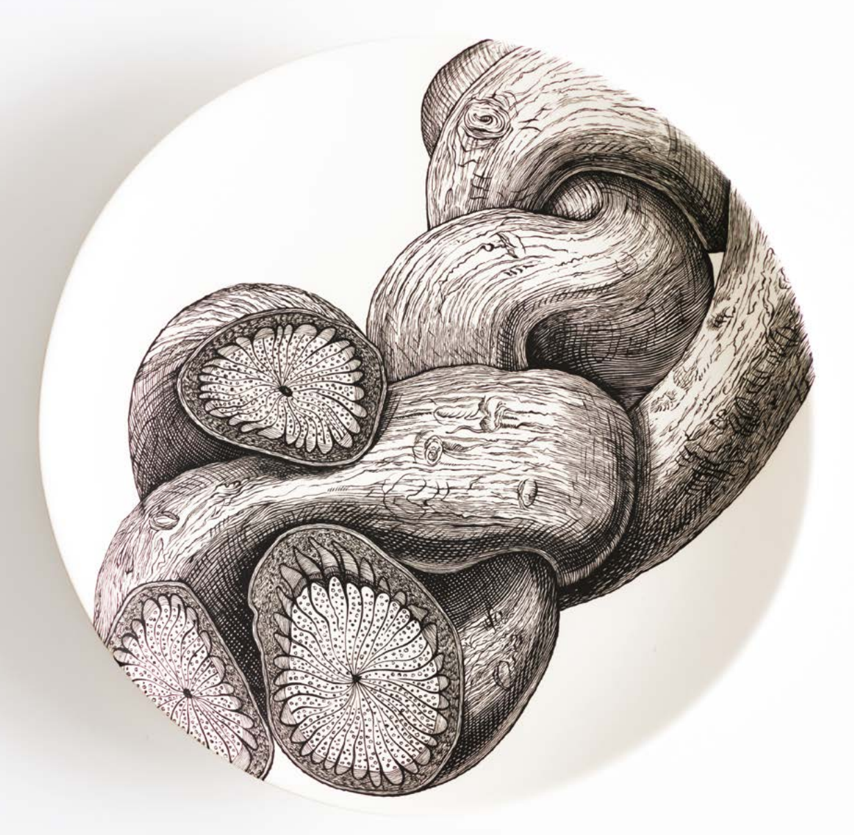
Susan Hipgrave Asclepiad 2010 Hand-painted, black underglaze on porcelain d28cms