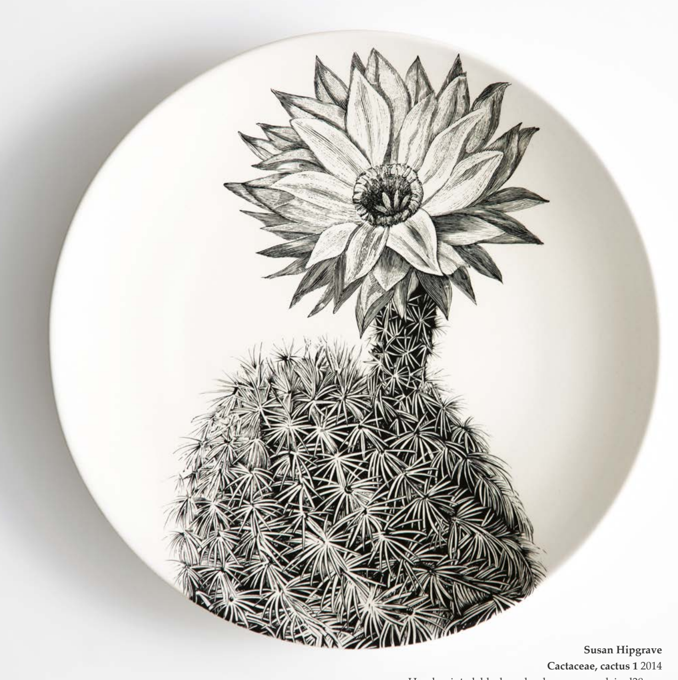
Susan Hipgrave hand-painted plates black underglaze on porcelain Photograph: Craig Wall

Photograph: Craig Wall Hand-painted, black underglaze on porcelain d28cms Photograph: Craig Wall 41