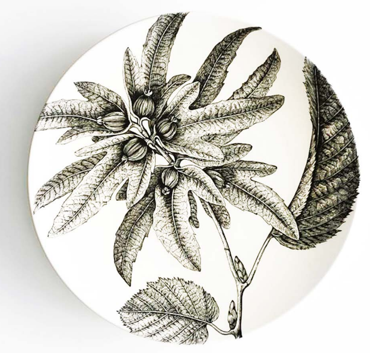
Susan Hipgrave Carpinus Betulus,the Hornbeam 2012 Hand-painted, black underglaze on porcelain. d28cms