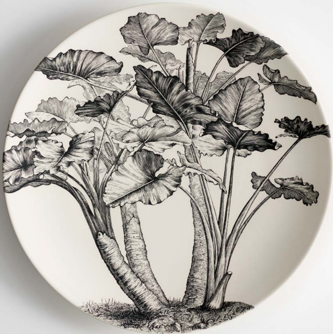
Susan Hipgrave Araceae Colocasia Odorata 2014 Hand-painted, black underglaze on porcelain d28cms