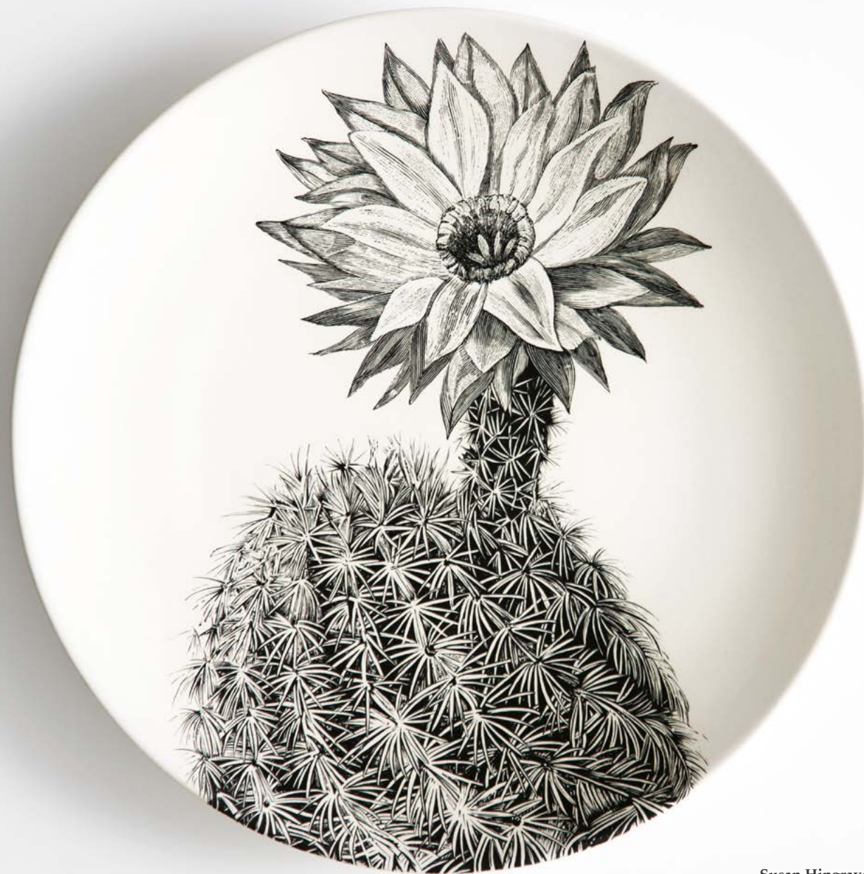
Susan Hipgrave Cactaceae, cactus 1 2014 Hand-painted, black underglaze on porcelain d28cms