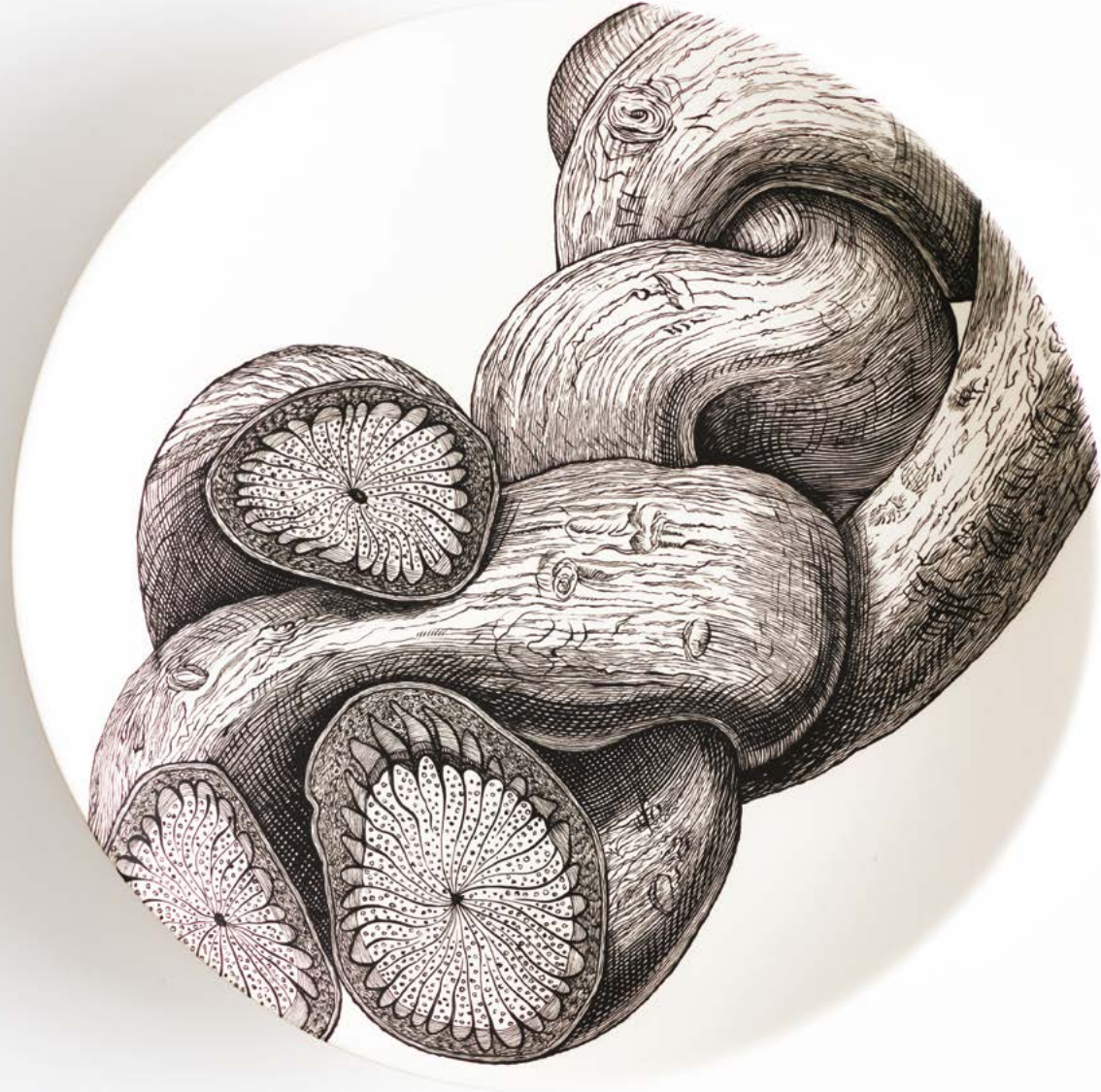
Susan Hipgrave Asclepiad 2010 Hand-painted, black underglaze on porcelain d28cms