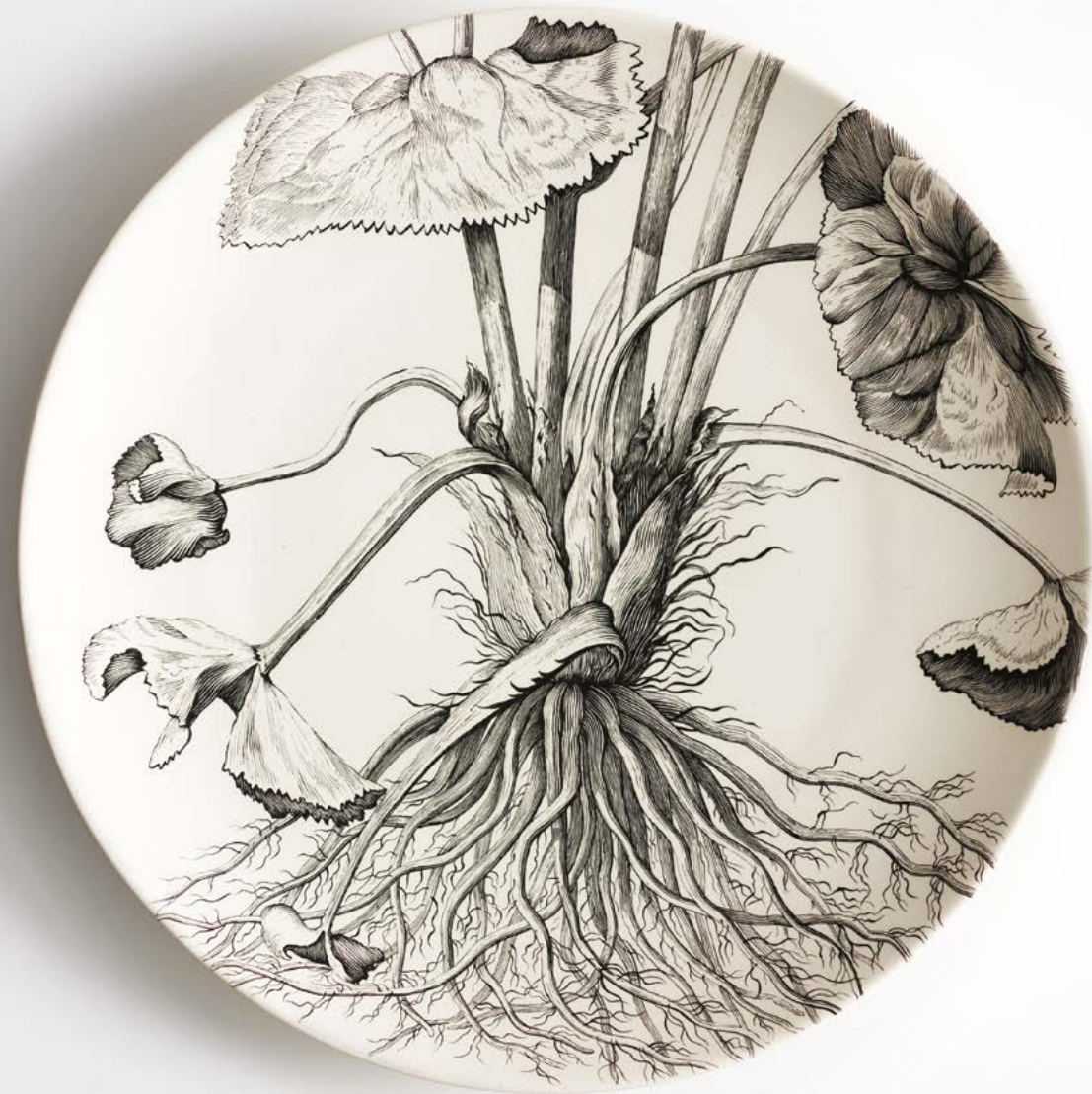
Susan Hipgrave Caltha Palustris Flore Simplicis 2014 Hand-painted, black underglaze on porcelain d28cms