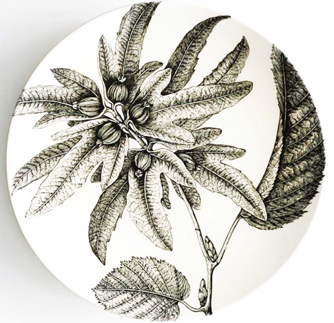
Susan Hipgrave Carpinus Betulus, the Hornbeam 2012 Hand-painted, black underglaze on porcelain. d28cms